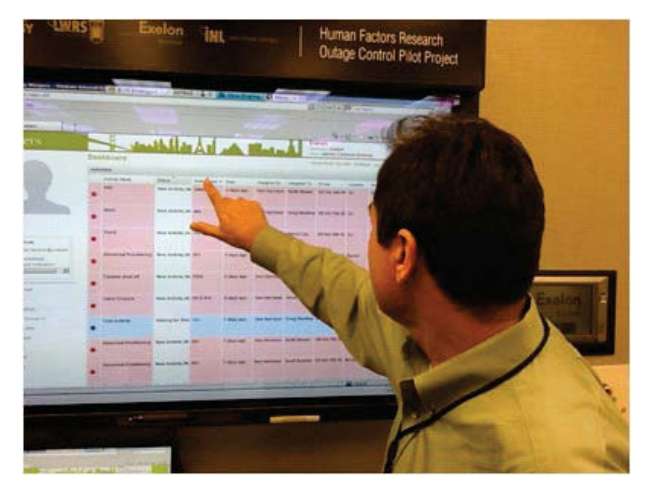
Figure 4 Task Status Display Format by Individual Task

Figure 5 depicts the third user interface, which displays the actual location of work teams in the field. It can also track and locate critical support personnel who need to be present for task completion. For example, if a Quality Inspector is needed to inspect a weld, the closest inspector can be located and sent to the work location immediately. The software can also locate inspection personnel when a designated step is reached in a procedure, alerting them to the request prior to the actual need time. This capability continues to be refined. The use of GPS technology to support this function in a NPP is not always reliable. Additional research efforts are being conducted to increase the capabilities of this function.