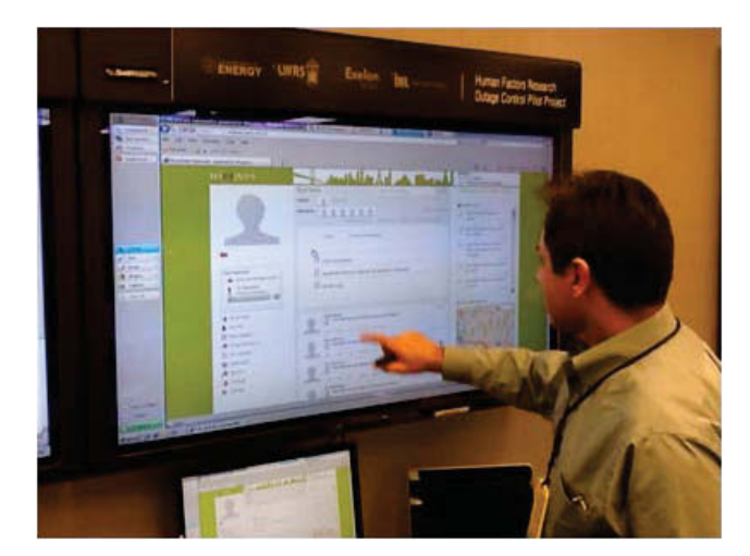
Figure 3 Screen Display of "Facebook" Configuration Display in Scrolling Format

This user interface allows managers to send and receive information such as safety updates, or other information much like text messaging, see Figure 3. The second user interface displays information in a task-based format that provides interactive capabilities to the OCC and WEC management team. As the status of the field activities change, the coloration of the display is automatically modified to alert the management team that action is needed to approve or disapprove field activities. This second interface is shown in Figure 4.