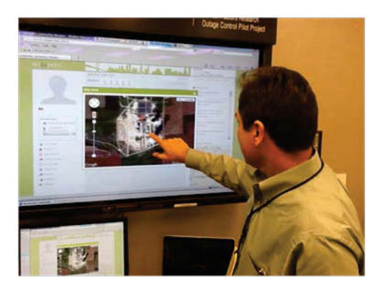
Figure 5 GPS Locating of Support Function

Figure 5 depicts the third user interface, which displays the actual location of work teams in the field. It can also track and locate critical support personnel who need to be present for task completion. For example, if a Quality Inspector is needed to inspect a weld, the closest inspector can be located and sent to the work location immediately. The software can also locate inspection personnel when a designated step is reached in a procedure, alerting them to the request prior to the actual need time. This capability continues to be refined. The use of GPS technology to support this function in a NPP is not always reliable. Additional research efforts are being conducted to increase the capabilities of this function.