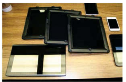
Figure 1 Hand-held Selections for Demonstration