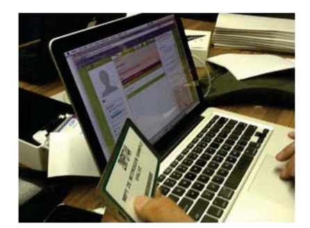
Figure 2 Pre-Test Checking of Barcode Scanning Capability

The critical steps of the procedure were loaded onto the Wizzpers database which could be displayed on both the SMART boards and the hand-held devices simultaneously. In addition, a copy of the plants bar-code library was also loaded onto the database, see Figure 2. This would allow the software to interrogate the equipment bar-code tags to assure that the correct piece of equipment had been selected by the field team.